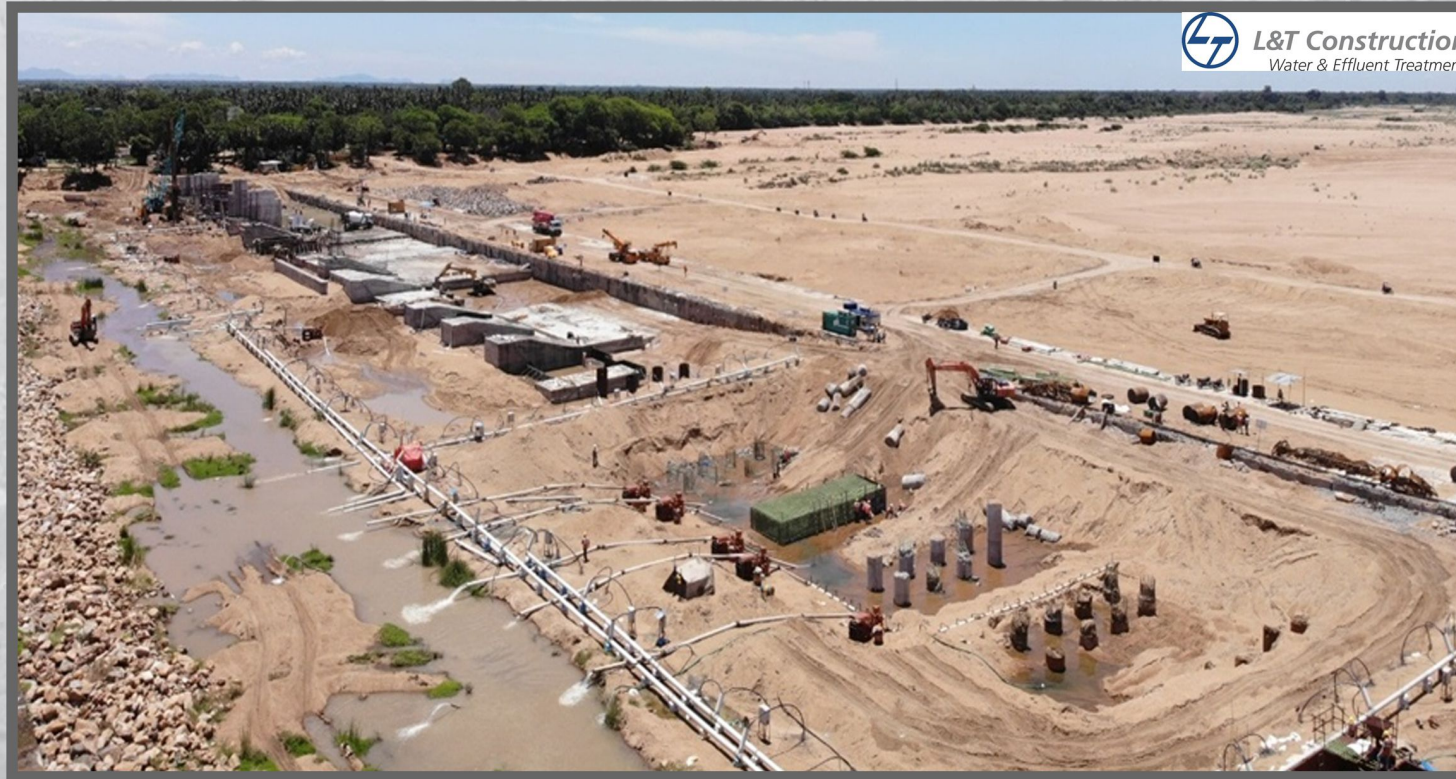
Mukkambu Dam Work In Vathalai, Trichy- Tamil Nadu